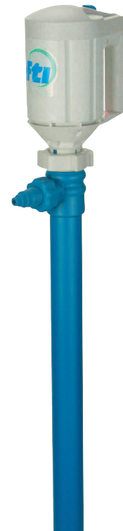
PFP with M3V motor