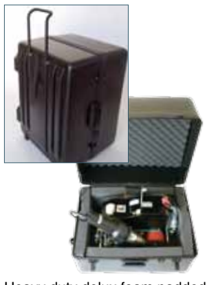
Heavy duty delux foam padded case included with Roofing Welder. Features a steel pullout handle and durable recessed wheels to protect and transport the machine.

Our Roofing Welder includes 20 pound weights, redesigned nozzle and wheeled carrying case. Available in both 230V and 120V.