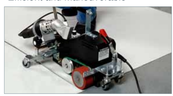
Convert the P2 to tape welder with 50mm Tape Kit F1091P2