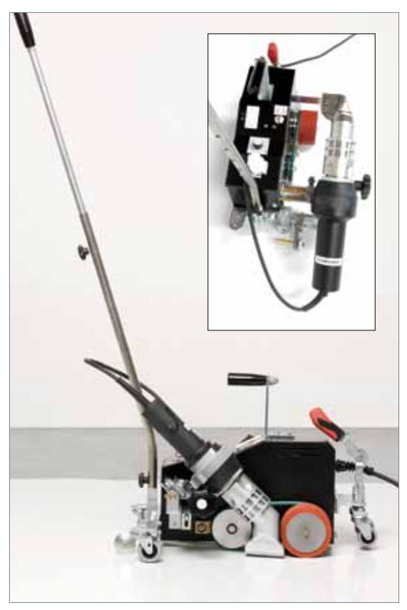
Efficient and Maneuverable