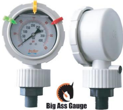
Big Ass Gauge