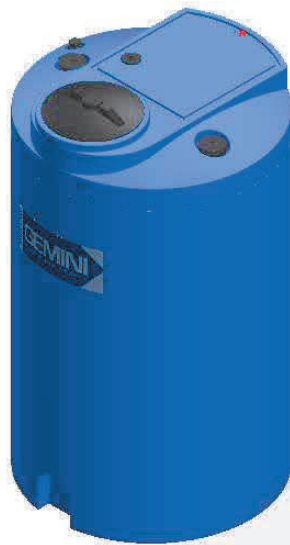
ISOMETRIC VIEW (ASSEMBLED)