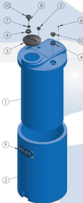
ISOMETRIC VIEW (EXPLODED)