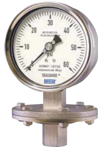
Diaphragm Pressure Gauge Model 432.50

Ambient: -4°F to +140°F (-20°C to +60°C) Medium: +212°F (+100°C) maximum Storage: -40°F...+158°F (-40°C to +70°C) -4°F...+158°F (-20°C to +70°C) for ranges ≤ 25" H 2 O (60 mbar)